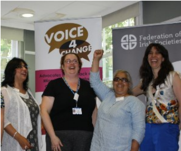
Alternative Perspectives Conference

In the build up to the launch of our policy document examining the argument for the continuation for the growth of specialist BME services, in April 2012 we organised a conference, 'Alternative Perspectives' in partnership with London Irish Centre, Federation of Irish Societies and the Afiya Trust on culturally sensitive health and social care services. This allowed organisations to come together and share best practice and policy issues for the sector across healthcare. This was attended by 67 people from 38 organisations.