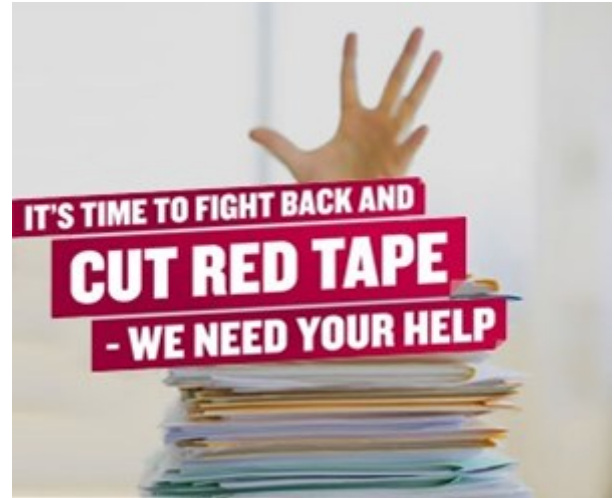
Red Tape Challenge